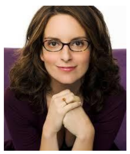
Tina Fey Bossy Pants